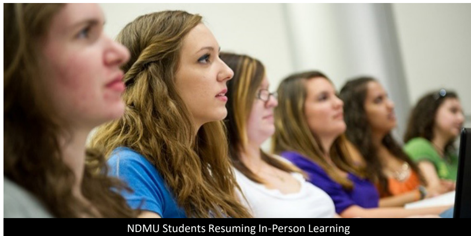
NDMU Students Resuming In-Person Learning

At Notre Dame of Maryland University, Advent coincides with final exams – a time of preparation, of late nights that become early mornings. It is an end as much as a beginning. And it seems most appropriate – Advent is an invitation to prepare yourself