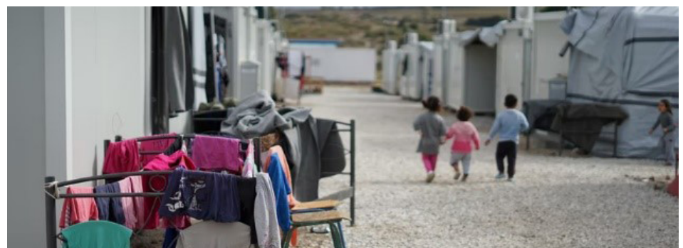
Syrian Refugee Camp in the Outskirts of Athens

Finally, I would note that in another passage of the Gospel Jesus says: “I was a stranger and you welcomed me” (Mt 25:35)...For Christians, the words of Jesus have an even deeper meaning. They compel us to recognize Christ himself in each of our abandoned or excluded brothers and sisters (cf. Mt 25:40.45). Faith has untold power to inspire and sustain our respect for others, for believers come to know that God loves every man and woman with infinite love and