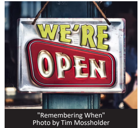
"Remembering When"

Laudato Si' challenges us to really see each other and our deep connection to the created order as truly sacramental, pointing us in the direction of God. To see those on the border of Poland, to see those on the border of Mexico, to see the vulnerable members of our communities wherever we live. To see the effects of climate change not as what happens to others, but that