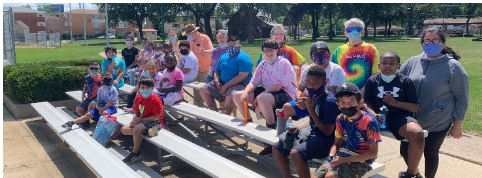
Youth at Corazón's Summer Achievement Camp

With gratitude and warmth, staff at Corazón welcome all as we hope to show this is their home away from home.