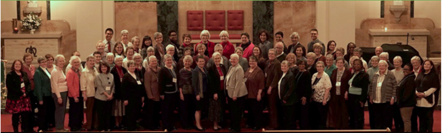
Participants gathered at the 2020 Annual Leadership Meeting