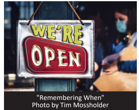
"Remembering When"

Laudato Si’ challenges us to really see each other and our deep connection to the created order as truly sacramental, pointing us in the direction of God. To see those on the border of Poland, to see those on the border of Mexico, to see the vulnerable members of our communities wherever we live. To see the effects of climate change not as what happens to others, but that when it happens to others it