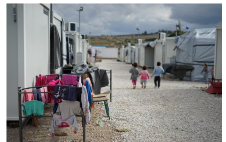
Syrian Refugee Camp in the Outskirts of Athens

We likewise believe that Christ shed his blood for each of us and that no one is beyond the scope of his universal love. If we go to the ultimate source of that love which is the very life of the Triune God, we encounter in the community of the three divine Persons the origin and perfect model of all life in