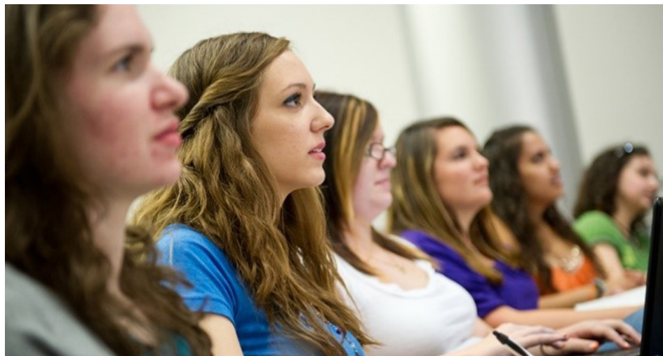
NDMU Students Resuming In-Person Learning

to come, grounded in relationship and beckoned forth by light. In this particular year, the commitment, the dedication and the resiliency of our students, staff and faculty in many ways reflects a community that practices true hospitality – the expectation that you will be your most authentic self, the invitation to share your gifts, and the privilege of supporting those around you.