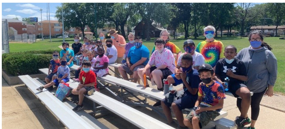
Youth at Corazón's Summer Achievement Camp

old or new interests in teaching or simply helping others along their path. They are an integral part of our ministry as they help us carry out what we hope to accomplish with our learners-- transformation through connection!