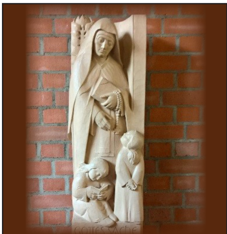
Mother Theresa statue in the house chapel in Stadtamhof.

Director of Mission and Ministry, Academy of the Holy Angels, Demarest, NJ