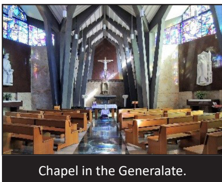
Chapel in the Generalate.

ESL Program Coordinator, Corazón a Corazón, Chicago, IL