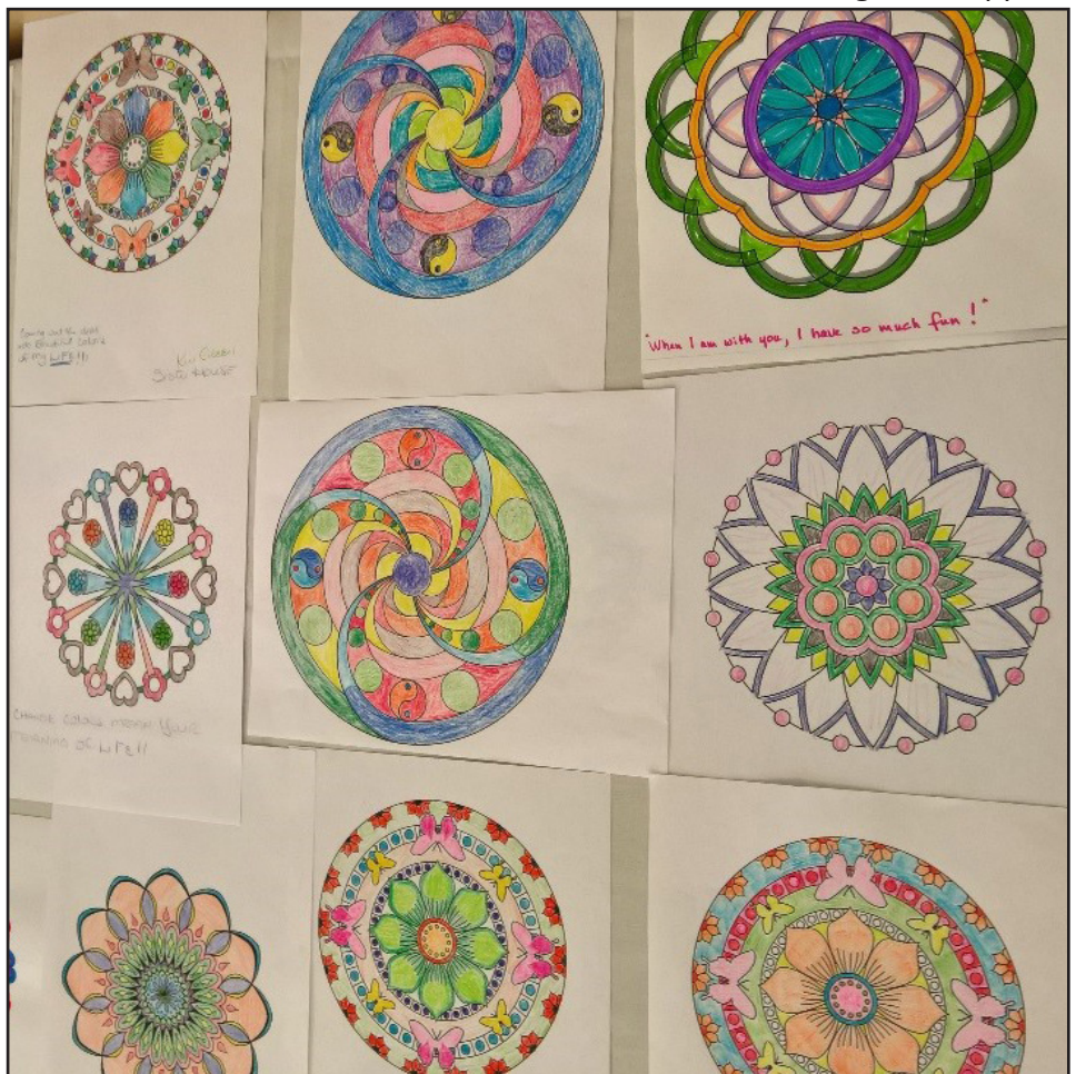
Mandalas created as part of a prayer experience during the retreat.