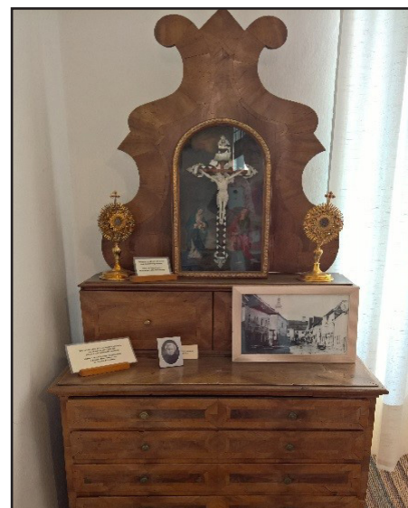
Blessed Theresa's Prie-Dieu

I was humbled to kneel and pray on Blessed Theresa's prie-dieu. I felt a sense of awe and peace as we sang Vespers at Blessed Theresa's tomb in Munich. I prayed for Blessed Theresa's strength and vision, and I wondered how she would address the challenges that face us today. One of the highlights of the trip for me was spending my birthday