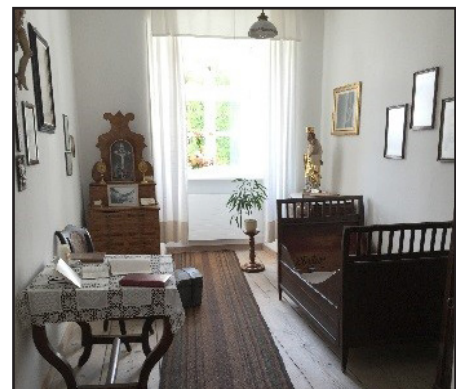
Mother Theresa's Bedroom

Laughing and hearing each of my fellow pilgrims' reflections during the trip was something I will not forget. Mother Theresa's spirit is alive in us all, and I feel excited and energized to continue to work to unite through our little Corazón community.