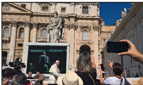
Audience with Pope Francis