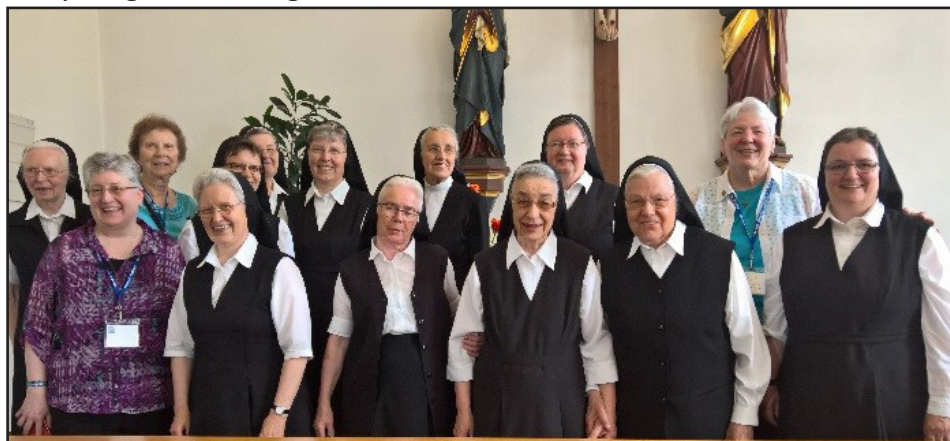
Sisters in their chapel in Neunburg vorm Wald.

of the community that you share with each other.