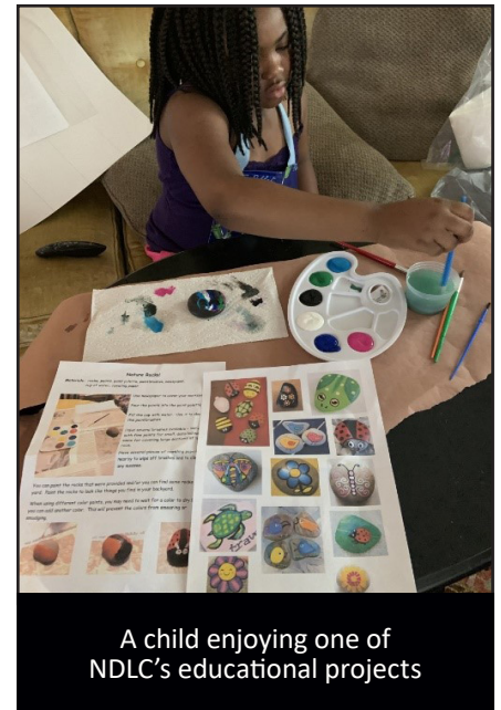
A child enjoying one of NDLC's educational projects

is already planning an August 2021 tournament. Until we can welcome the children and tutors back to the center we will continue to videoconference, phone, and e-mail with everybody! Tutoring will continue online and more projects can be delivered. One way or another, we will be ready to meet the needs of our children.