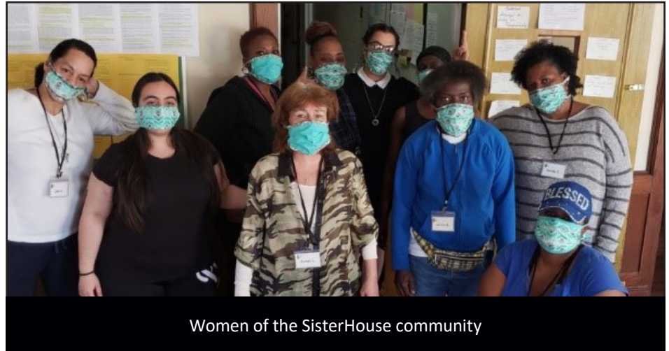
Women of the SisterHouse community

structured life skill program and additional supportive housing units, we have kept our clients safely housed, in treatment and working towards their goal of self-sufficiency.