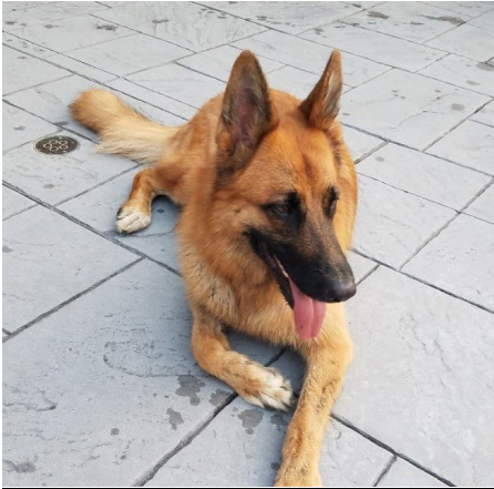
Greta, the German Shepherd – DOG or GOD?

American Vocation Team. I could feel the rewards of the previous days and could successfully claim the fire within. It was definitely time well spent.