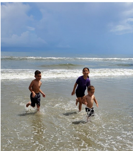
Henry's grandkids at the beach.