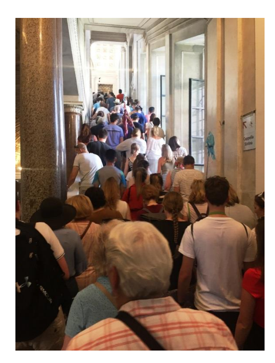
through, "Avanti! Avanti!"

Today we went to the Vatican Museum with the hope of visiting the Sistine Chapel. That this was challenging is an understatement! Our guide led us through various exhibits at the unexpectedly hot and crowded museum. The breeze from the open windows let in only wisps of relief. Halfway to the Sistine Chapel our guide received notice that the Chapel had been closed. We were led out of the building only to learn an hour later that the chapel had reopened.