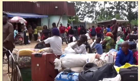
Internally Displaced Persons in Douala