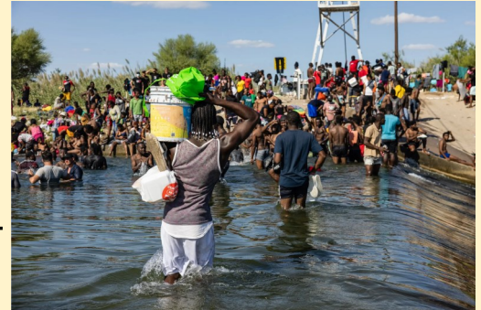
Migrants crossed the Rio Grande between Texas and Mexico with supplies Thursday as they prepared to spend the night under the international bridge connecting Del Rio and Ciudad Acuña.

Their fears of deportation are tragically well-founded, as by the week before Thanksgiving (on 11/16)—and just days after the U.S. and Canada advised their citizens to leave Haiti for security reasons, ICE sent their 83rd Haiti deportation flight in less than two months (since 9/19). More than 8,700+ Haitians have been recently expelled to well known and life threatening dangers.