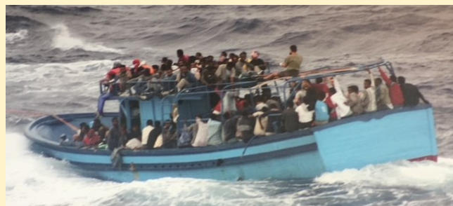
Image of a migrant ship off the shores of Lampedusa.

Upon arrival, the Mediterranean Hope project of the Federation of Evangelical Churches in Italy worked in partnership with a local lawyer to gather her story from other migrants and tediously locate her brother previously resettled in Sweden. Eventually, a prayer ceremony was held, a video recording was sent to her brother, and a gravesite was purchased for her in the local cemetery—where now her picture still gives testimony to her life and hopes.